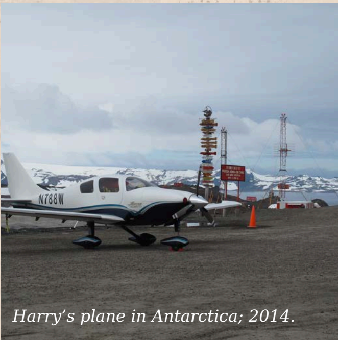
Harry's plane in Antarctica; 2014.

stories to fill a lifetime twice over. Such vast experiences come with many questions for onlookers,